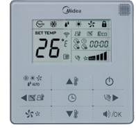
Wired Controller KJR29B (optional)