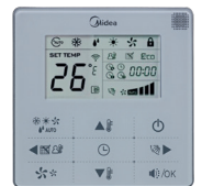
Wired Controller KJR29B (optional)